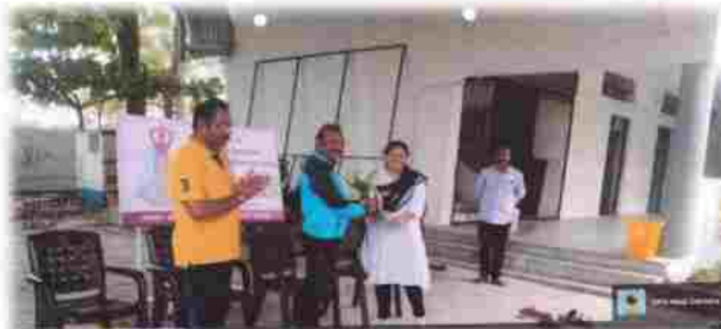
Latur, Maharashtra, India Dayanand Education Society Campus, Barshi Road, CH24+QM5, near Shivaji Chowk, Prakash Nagar, Latur, Maharashtra 413531, India Lat 18.401968° Long 76.555491° 06/05/22 09:06 AM