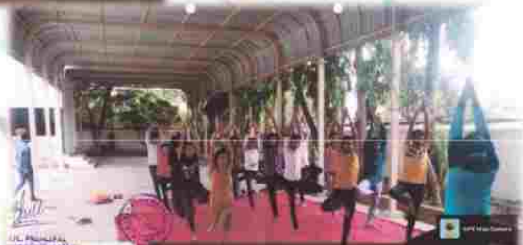
Latur, Maharashtra, India Dayanand Education Society Campus, Barshi Road, CH24+QM5, near Shivaji Chowk, Prakash Nagar, Latur, Maharashtra 413531, India Lat 18.401935° Long 76.556539° 06/05/22 07:42 AM